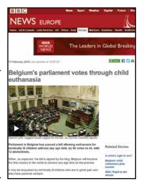
On February 13, 2014, once-Catholic Belgium became the first country on earth to approve of euthanasia for children of all ages.

In Rwanda, there is a plan underway to sterilize 700,000 men over the next three years. It is being done in the name of population control, and with the encouragement of groups funded by the United States Agency for International Development.